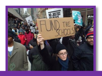
Three Actions Philly Must Take Before Building a New Prison