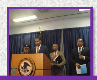
A Reminder of Costly Police Reforms