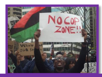
Surveillance, Over-Policing and How to Achieve Safe Communities