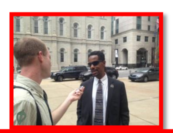
After Decades, Civilian Oversight in Philly Takes Shape