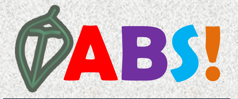
Original stories of impact, issue, inspiration, and innovation.