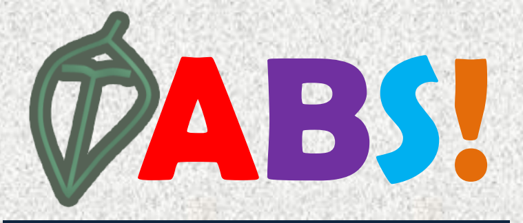
Original stories of impact, issue, inspiration, and innovation.