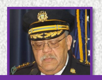
Mother of Man Killed By Philly Police Wants Commissioner to Resign