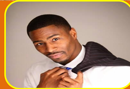
Brutal Honesty: How Being Tormented Made me a Mentor.