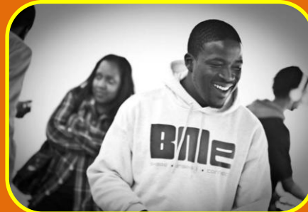
The Truth About Black Male Mentors.