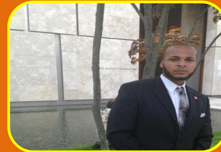
I Just Realized my First Boss was my First Mentor.