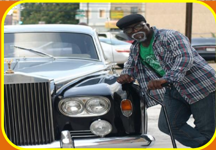
One Man Reflects on the Role Mentoring had on his Life.