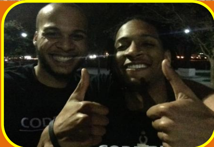
Blessed with a Brother from another Mother.