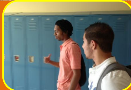
Paying it Forward: I'm still a Mentee, but now I Mentor.