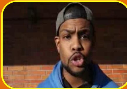
How My Final Suicide Attempt Attracted My First Mentor.