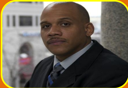
How A Young Father's Death Made Me A Mentor.