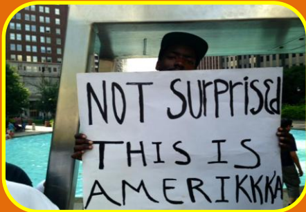
A Speechless Conversation between Mentor and Mentee.