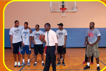
I Coach Because He Coached: Inspired by Men Who Mentor.