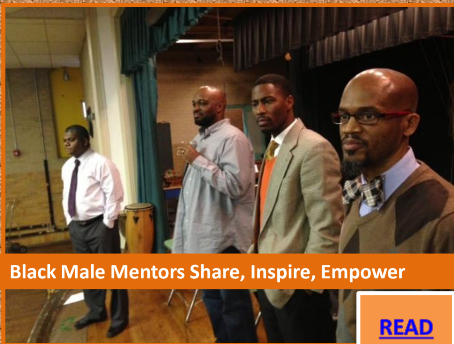
Black Male Mentors Share, Inspire, Empower