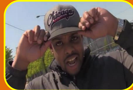
Mentor of Chicago Girl Who Died After Performing for Obama Speaks Out.