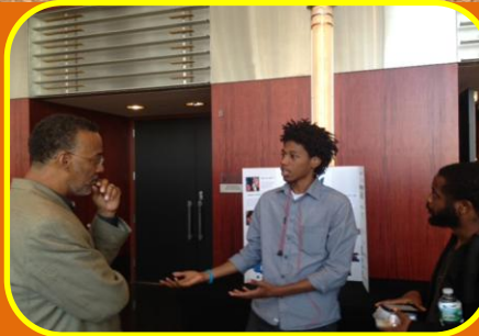
You Don't Have to be Perfect to be a Mentor.